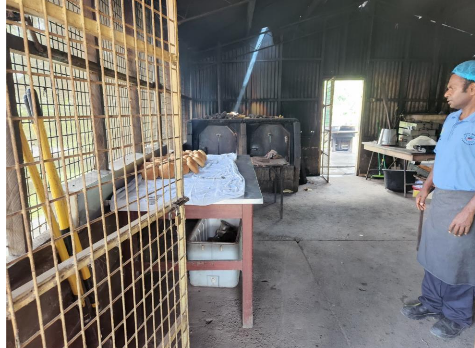
Top Left - Pictures of the baking area