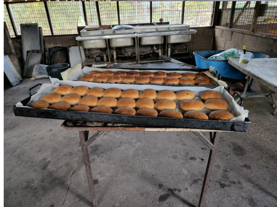
Bottom Left – pictures of the baked buns in the food preparatio n area