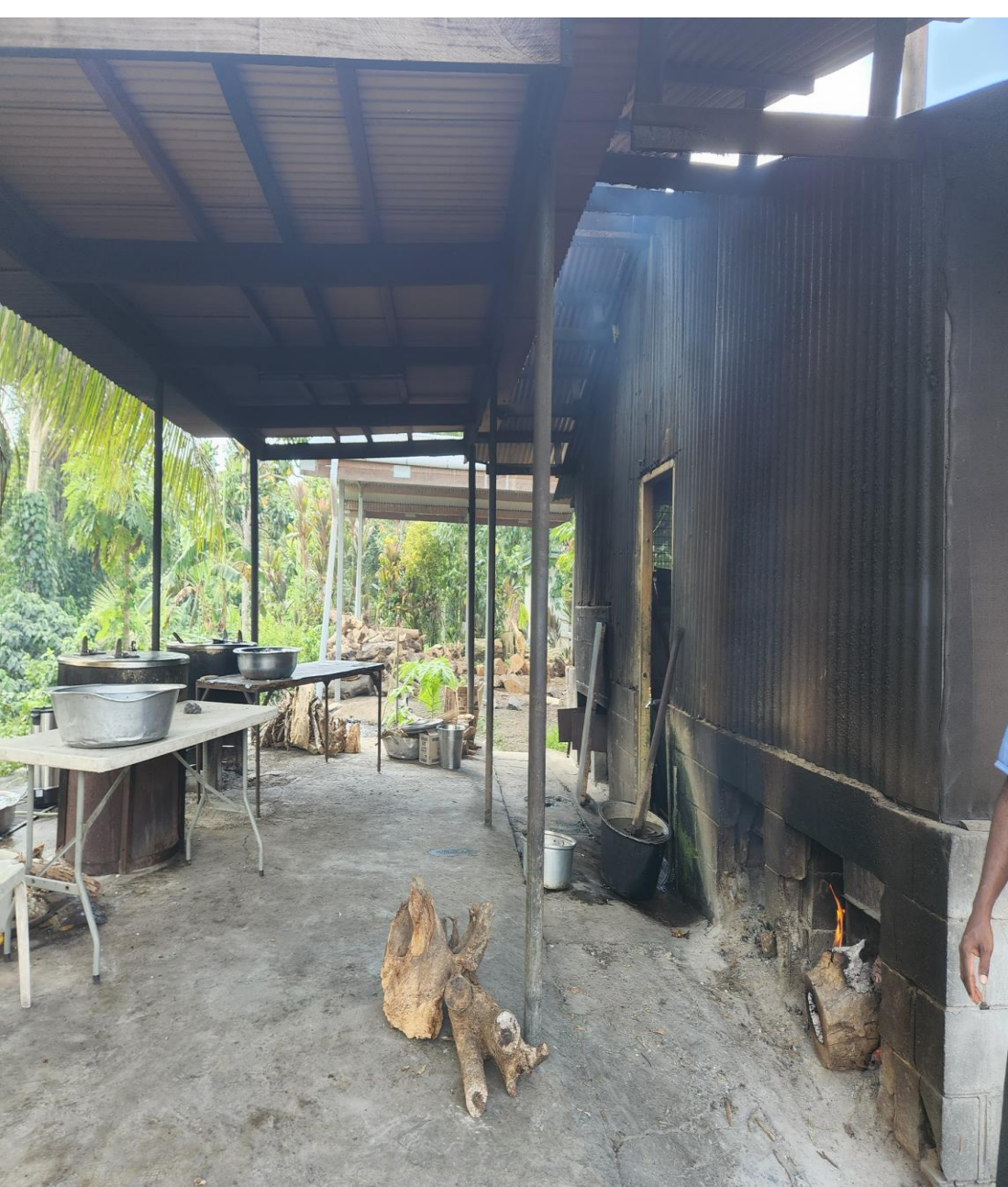
The oven from the outside washing area