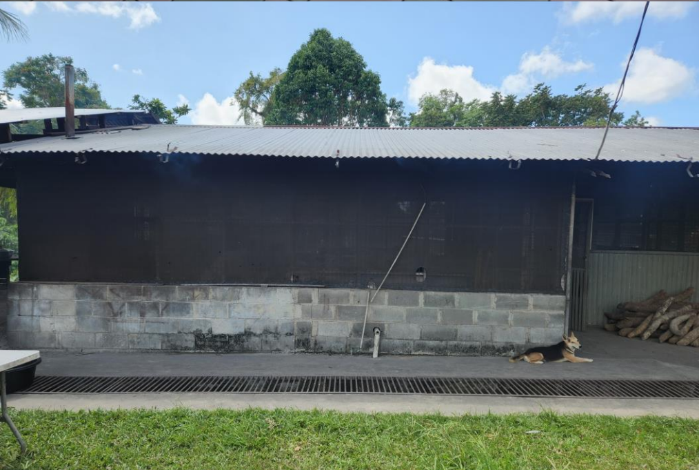
Right – entrance to the baking area