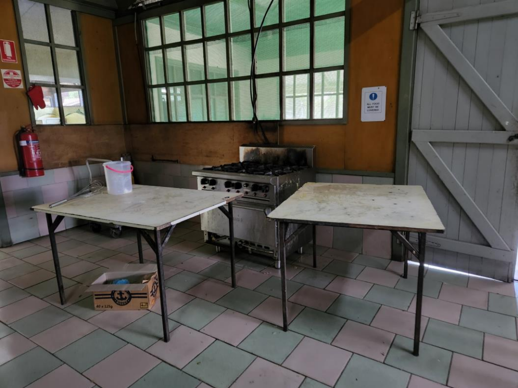
Bottom left – side view of baking area which is external to the cafeteria.