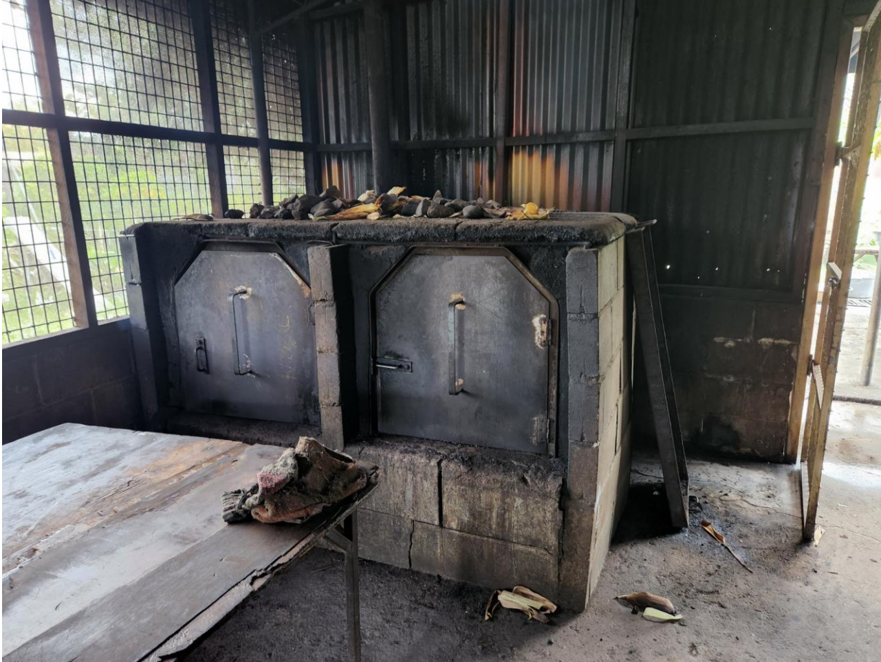
Current oven which sits in a separate room outside the cafeteria

Goal: To establish a bakery for the provision of bread to students and staff at Sonoma Adventist College and generate income to develop the College further.