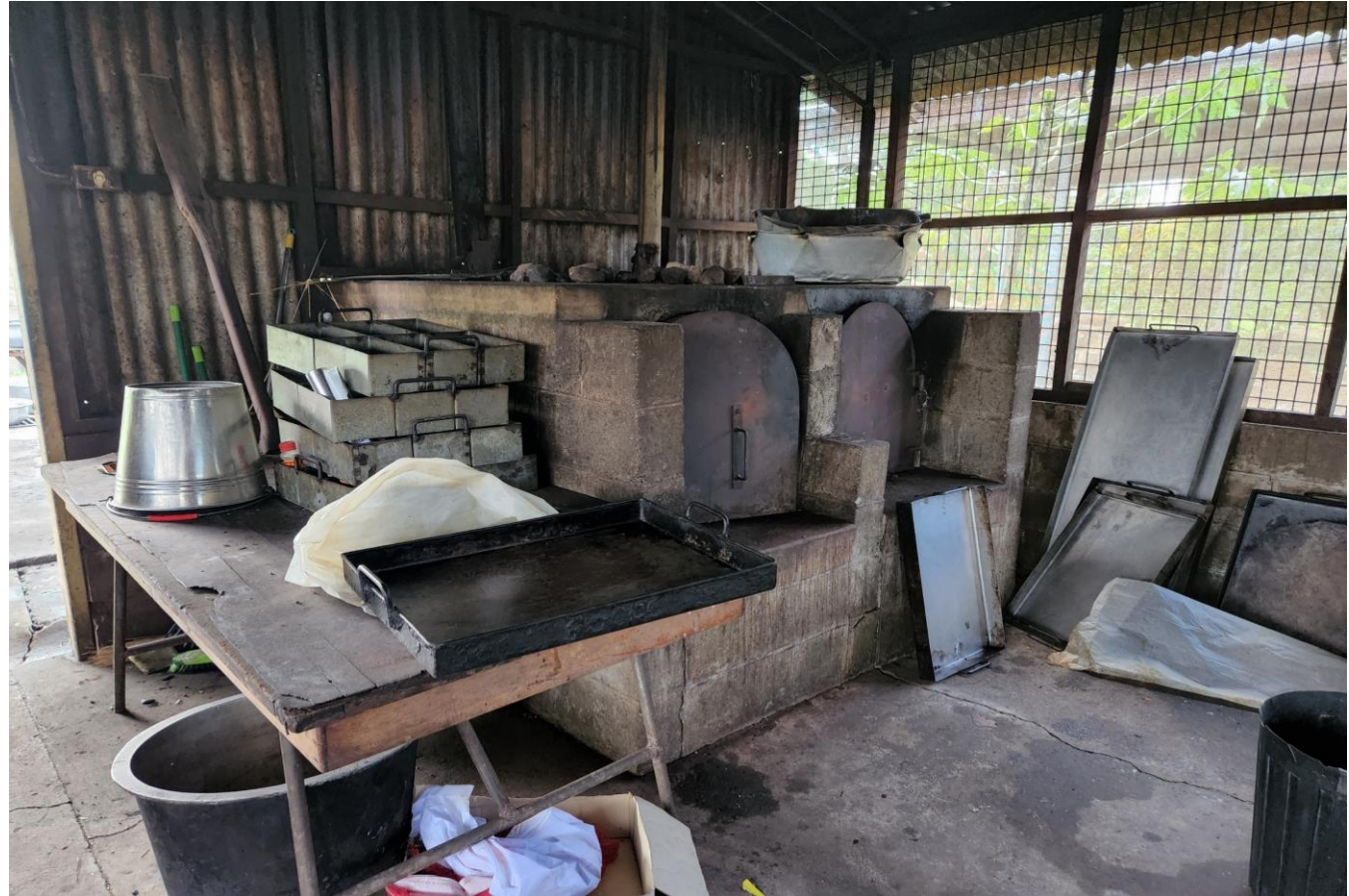
2 nd set of ovens and baking trays

The commencement of S2 and the return of students has highlighted the importance of getting the bakery project underway again.